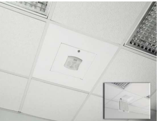
Suspended ceiling enclosures for wireless access points with detachable antennas. Interchangeable doors on enclosure permit easy upgrades to new APs and antennas.