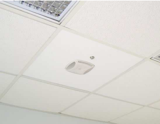
Secure, Convenient, Aesthetic suspended ceiling enclosures and mounts for wireless access points with non-detachable antennas or body integrated antennas